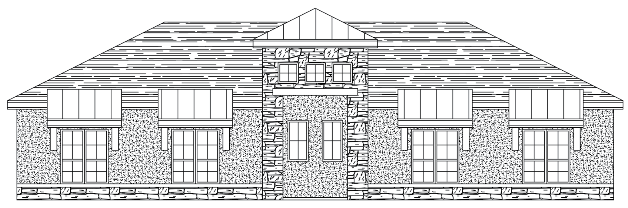
**Images provided are based on the builder's renderings and the actual building may look different than the images provided.

10920 NORTH COUNCIL ROAD, OKLAHOMA CITY, OK 73162